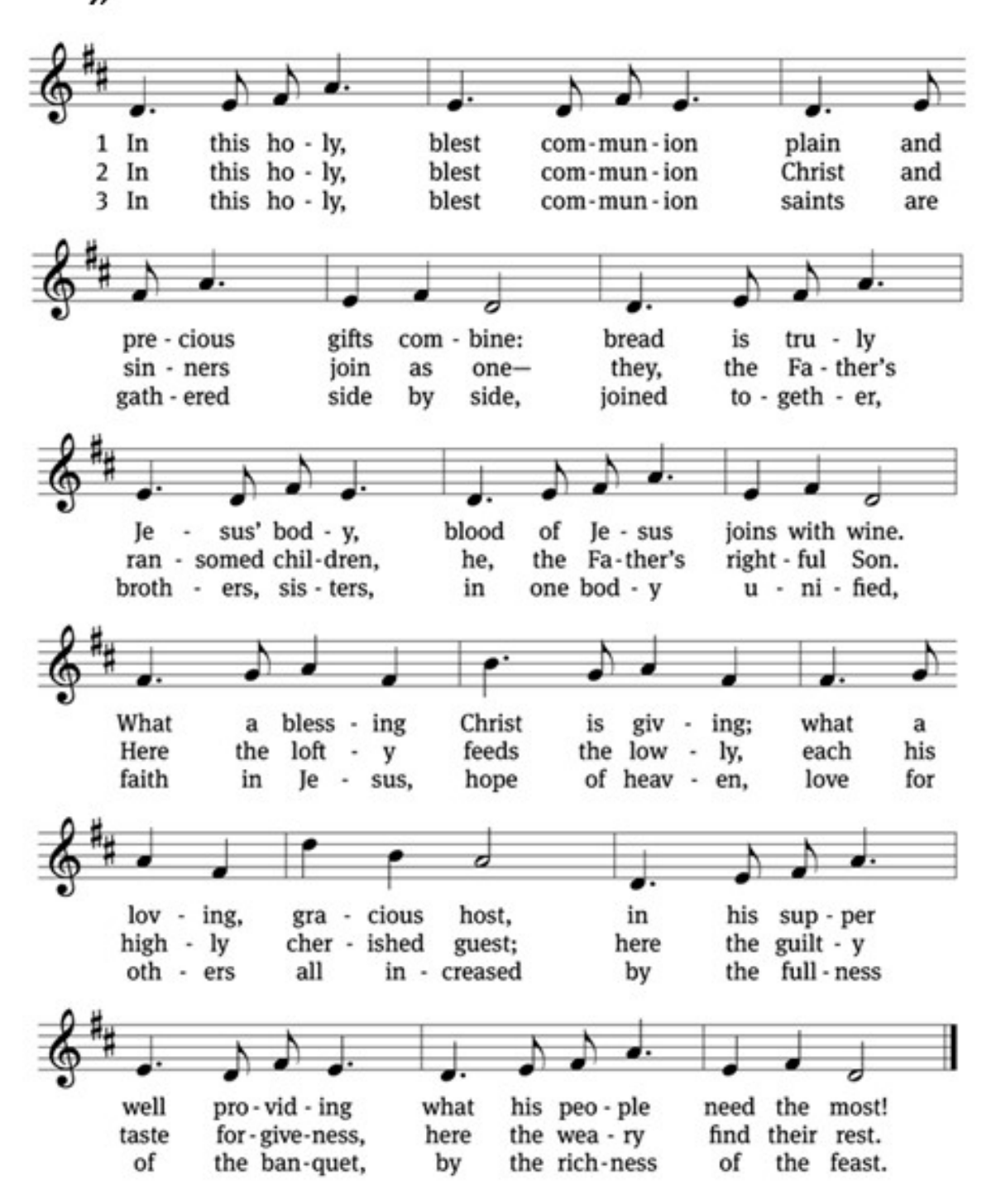
SERMON— "This Is a Holy, Blest Communion" Based on 1 Corinthians 10:16–17